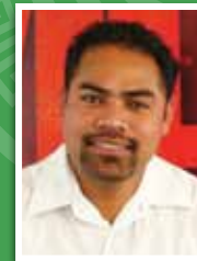
1. Kilisimasi Segá Auckland, NZ